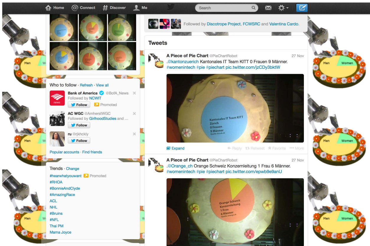
Image of the Project's Twitter feed

Click here for images: http://www.flickr.com/photos/12694553@N03/sets/72157637812833314/