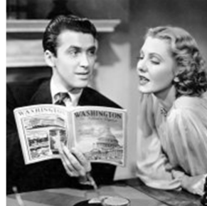
TUESDAY MATINEES: YOU CAN'T TAKE IT WITH YOU