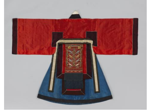
Treasures from Korea: Arts and Culture of Joseon Korea, 1392-1910