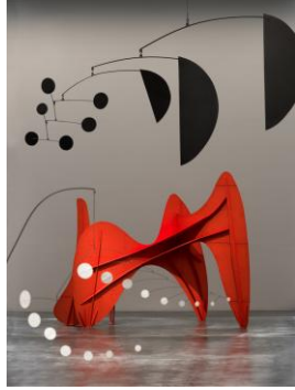
Calder and Abstraction: From Avant-Garde to Iconic

Current as of December 2013. Information is subject to change. For a listing of exhibitions and installations, please visit www.lacma.org