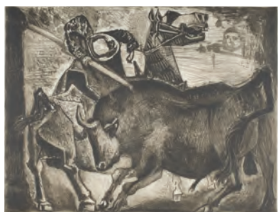
PICASSO AND HIS PRINTERS Through November 27 Ahmanson Building