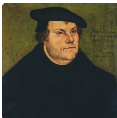
RENAISSANCE AND REFORMATION: GERMAN ART IN THE AGE OF DÜRER AND CRANACH Opens November 20 Member Previews: November 17–19 Resnick Pavilion