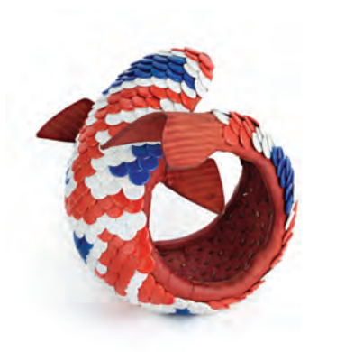
BEYOND BLING: JEWELRY FROM THE LOIS BOARDMAN COLLECTION Through February 5, 2017 Ahmanson Building