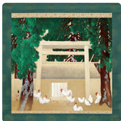
JAPANESE ART AT LACMA: CELEBRATING 10 YEARS OF THE JAPANESE ART ACQUISITIONS GROUP Opening December 24 Pavilion for Japanese Art