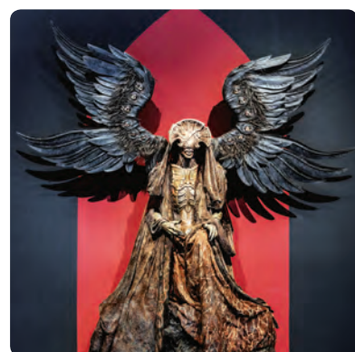
GUILLERMO DEL TORO: AT HOME WITH MONSTERS Through November 27 Art of the Americas Building