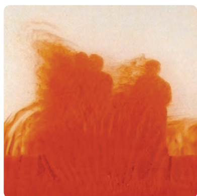
SENSES OF TIME: VIDEO AND FILM-BASED WORKS OF AFRICA Through January 2, 2017 Hammer Building