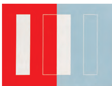
JOHN McLAUGHLIN PAINTINGS: TOTAL ABSTRACTION Opens November 13 Member Previews: November 10–12 BCAM