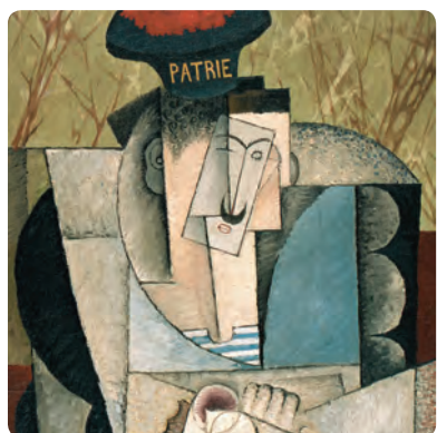
PICASSO & RIVERA: CONVERSATIONS ACROSS TIME Opening December 4 Member Previews: December 1–3 BCAM