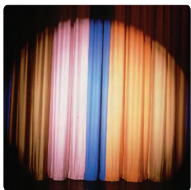
TV ON FILM Through March 12, 2017 Hammer Building